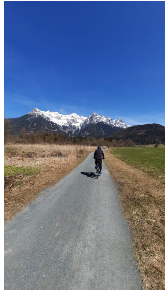
Safely on the move with the university-Student assistants in the outdoor area